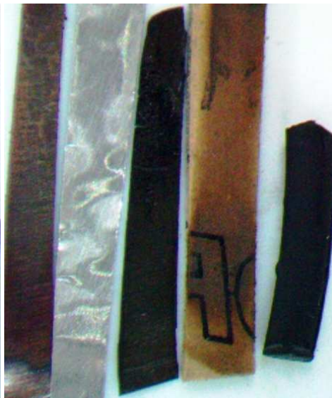
R-407C Test: Cu, Al, Fe, Gasket, O-Ring

This report is for the exclusive use of Intertek's Client and is provided pursuant to the agreement between Intertek and its Client. Intertek's responsibility and liability are limited to the terms and conditions of the agreement. Intertek assumes no liability to any party, other than to the Client in accordance with the agreement, for any loss, expense or damage occasioned by the use of this report. Only the Client is authorized to permit copying or distribution of this report and then only in its entirety. Any use of the Intertek name or one of its marks for the sale or advertisement of the tested material, product or service must first be approved in writing by Intertek. The observations and test results in this report are relevant only the sample tested. This report by itself does not imply that the material, product or service is or has ever been under an Intertek certification program.