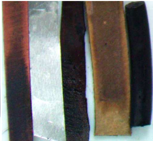
R-410A Test: Cu, Al, Fe, Gasket, O-Ring