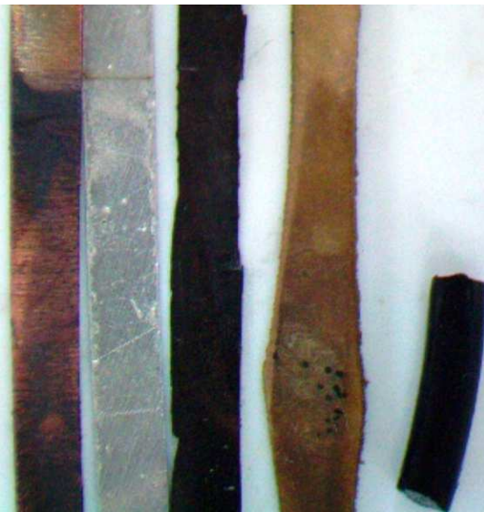
R-407C Control: Cu, Al, Fe, Gasket, O-Ring