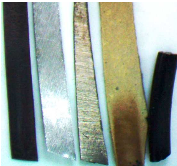
R-134a Control: Cu, Al, Fe, Gasket, O-Ring